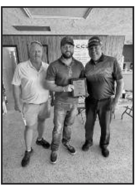
Audible Release, May 2024