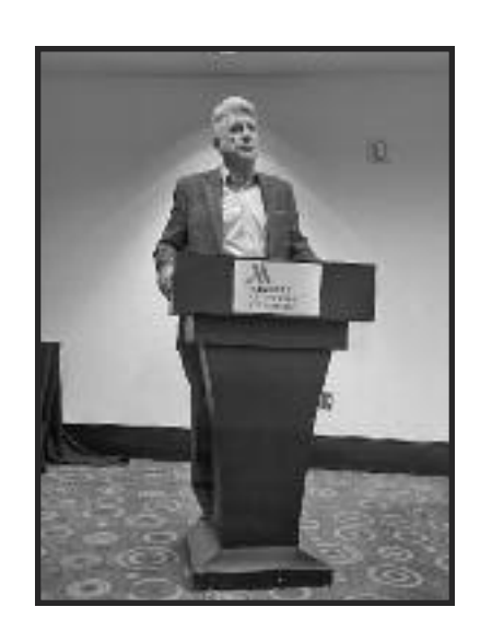
Audible Release, Nov/Dec 2023