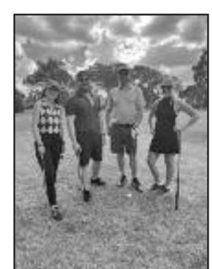
Golf Tournament Winners!!