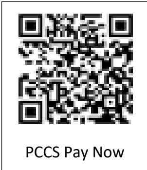
PCCS Pay Now

*Paper & Online renewal form only needs to be completed if contact info has changed.