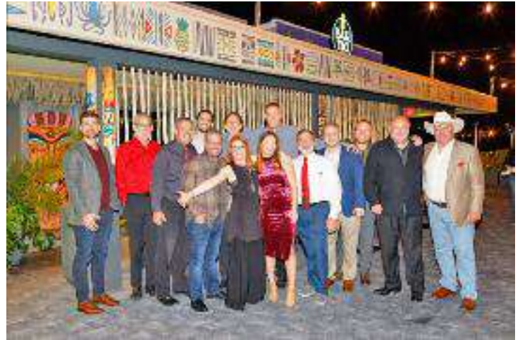
PCCS Board of Directors