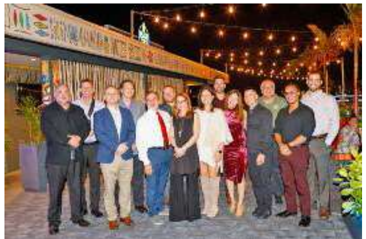
NUHS interns, alumni, and faculty